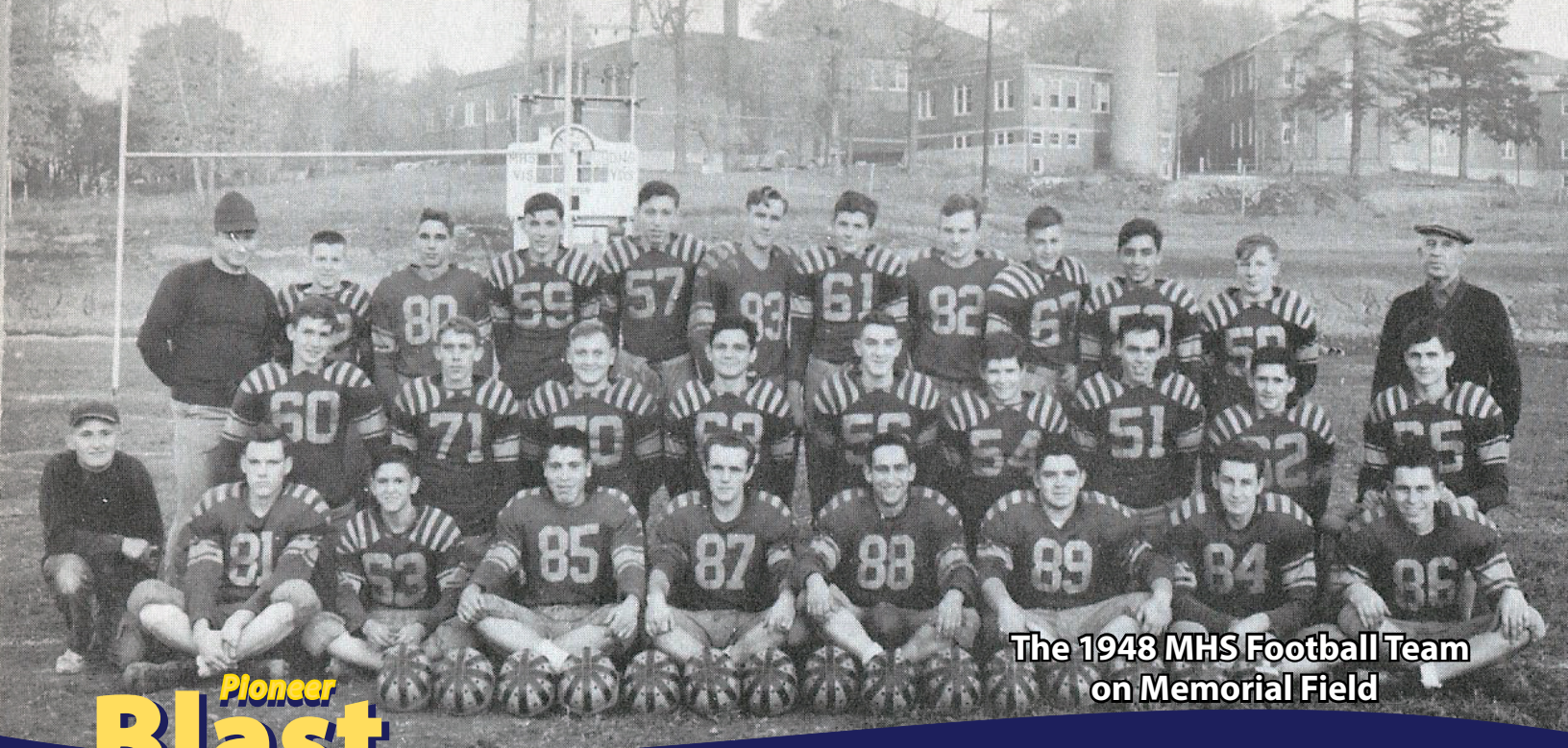
The 1948 MHS Football Team on Memorial Field