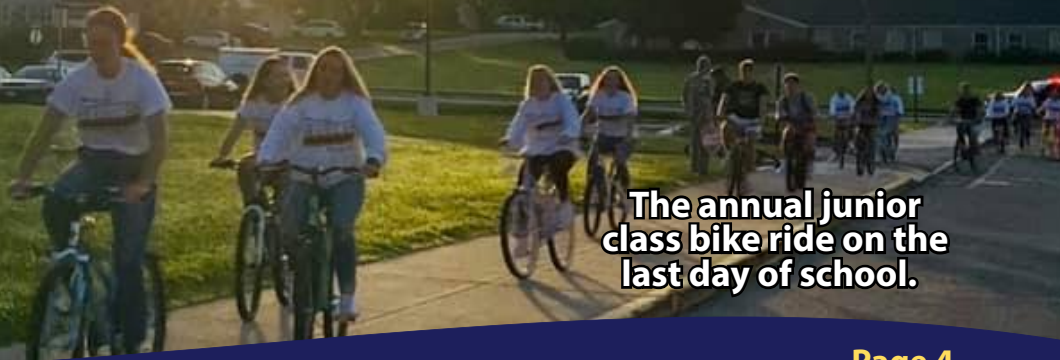
The annual junior class bike ride on the last day of school.