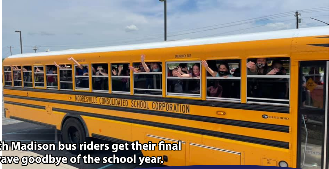
North Madison bus riders get their final wave goodbye of the school year.