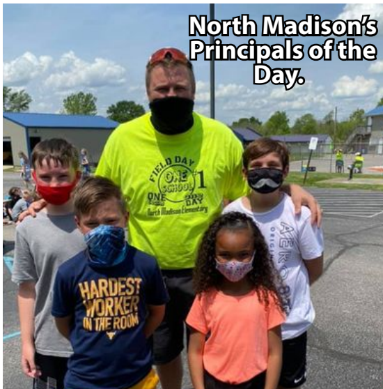
North Madison's Principals of the Day.